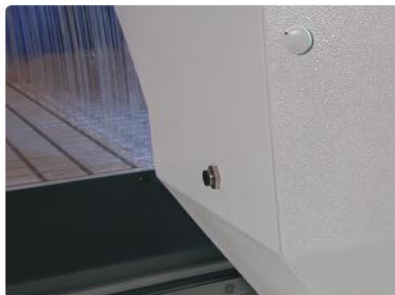
Safety Impact Sensor