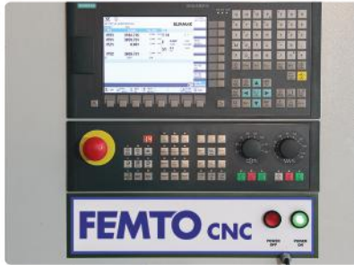
Control Panel (Siemens / Mitsubishi)