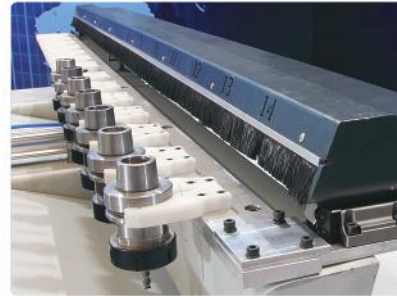
Tool Magazine (14 pieces)