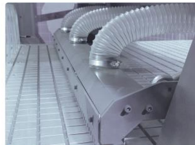
Automatic Sweeping and Plate Transferring